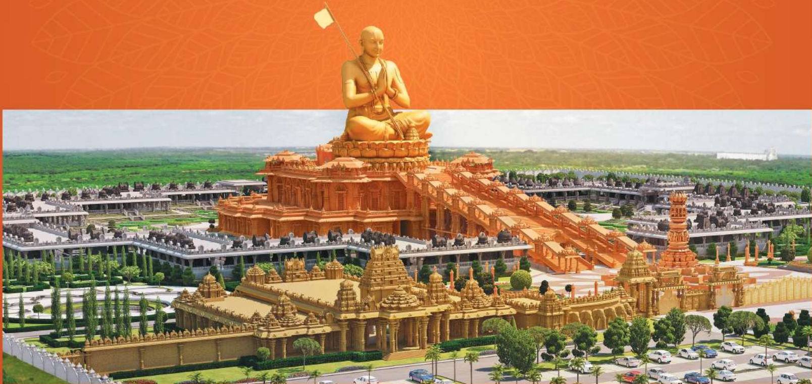
Spectacular panoramic view of Samatha Murthy, Statue Of Equality with the magnificent 108 Divya Desa:s, Divine Places Of Inspiration