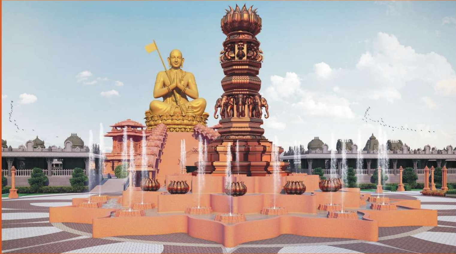
This Dynamic Fountain, pays obeisance to the Statue Of Equality of Sri Rama:nuja:cha:rya

The purity of his heart, convinced His mentors, rulers, bureaucrats, elite and the common man to tread the path of Bhakti - Divine Love.